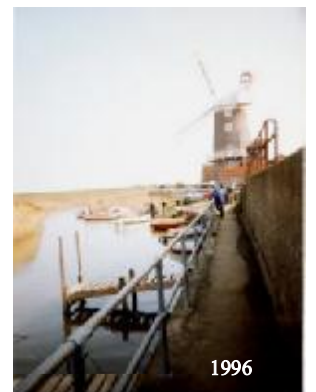
Compare the 2004 photographs with these of 1930 & 1996