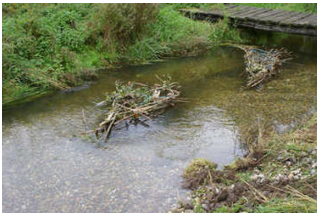
Mid-stream islands after putting riffle 3 in place [06/10]