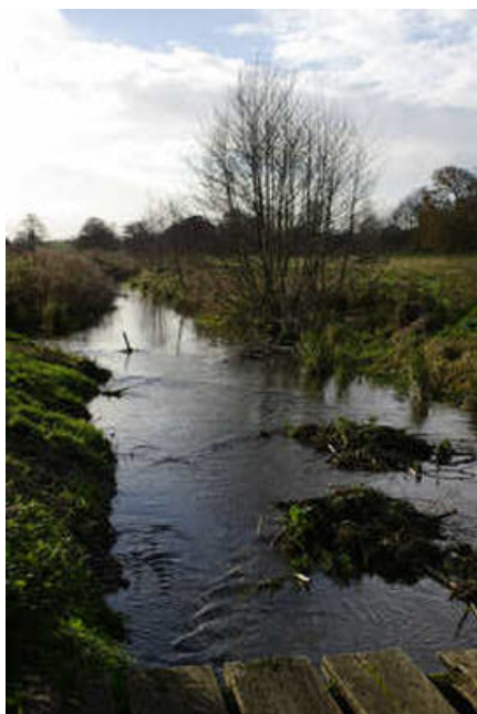
Mid-stream islands at 2 months after construction [07/12]