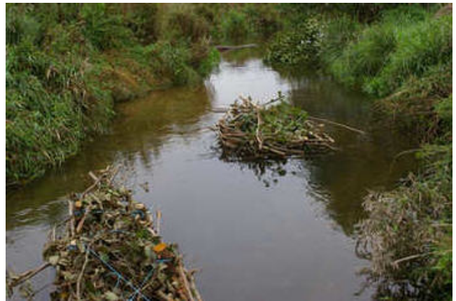
Mid-stream islands constructed (and LWD 2 upstream) [05/10]