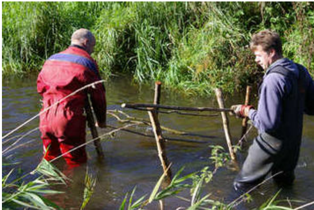
Mid-stream island; weaving hazel around the perimeter stakes [04/10]