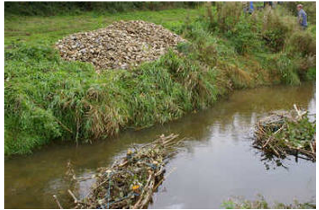
Stone brought up for riffle 3 (around islands) [05/10]