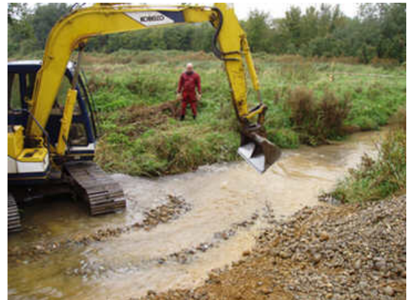
Installing cattle crossing 1 [06/10]