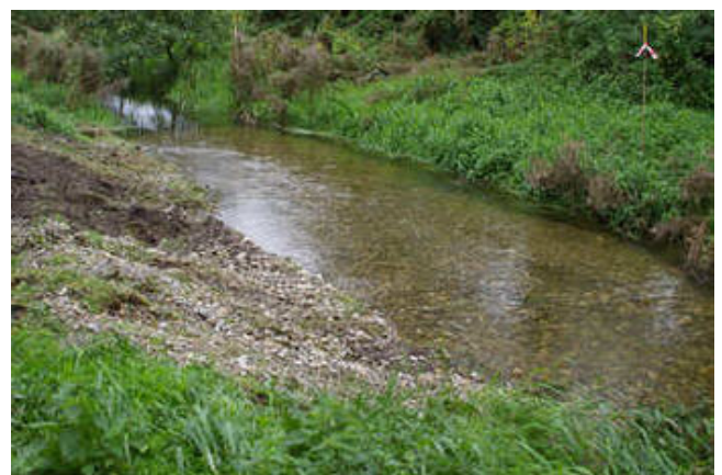
Stone and gravel having been put on place from bank to river by digger to create riffle 2; note deep "trout run" on west bank [06/10.]