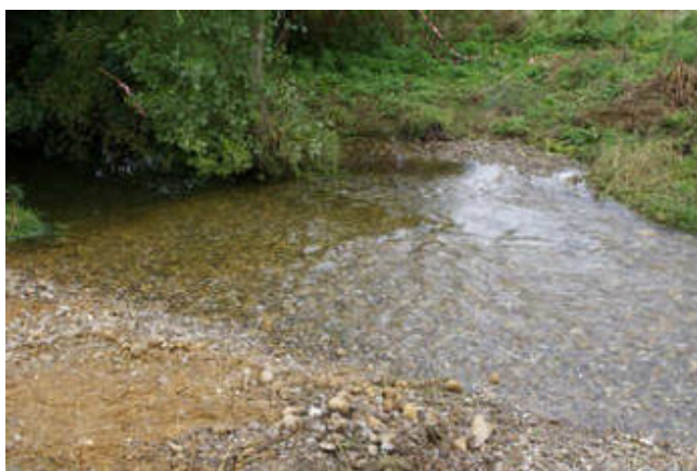
Stone and gravel in cattle crossing 1; continued downstream to make riffle 1 [06/10]