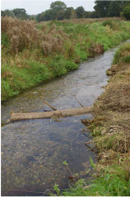
Riffle 5 in place; with LWD 5 set on top [16/10]