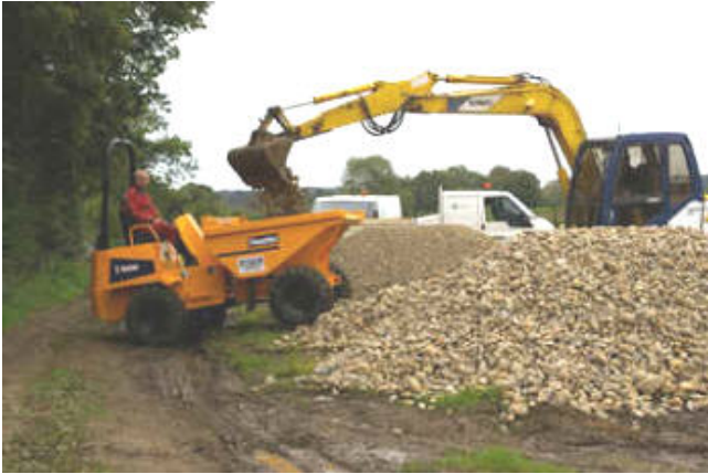
Drawing from the stone and gravel stockpile area (arable field) for riffle work [05/10]