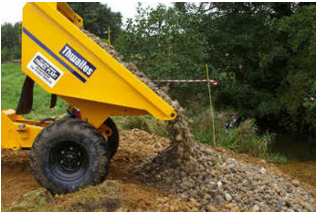
Stone being brought up for cattle crossing 1 [06/10]