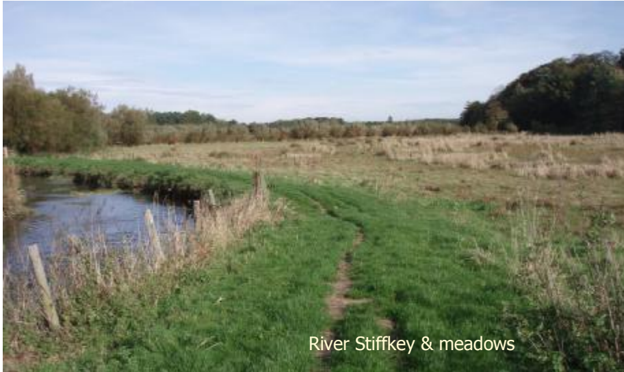
River Stiffkey & meadows

Downstream of the river meadows he created Stiffkey Fen, again a 'first', with the reversion of arable land to create a new habitat. The site was a 35 acre field, used for the cultivation of barley and 'wrapped around' by the river on two sides at the tidal sluice outfall. It was dug out to leave islands and flooded, and the water level maintained from the river when 'held-up' by the tidal sluice. Reed beds were planted, taking stock to start from some of that growing in nearby ditches. This became a valuable site for birds, used by over-wintering wildfowl and waders. The lapwing was his favourite bird. The