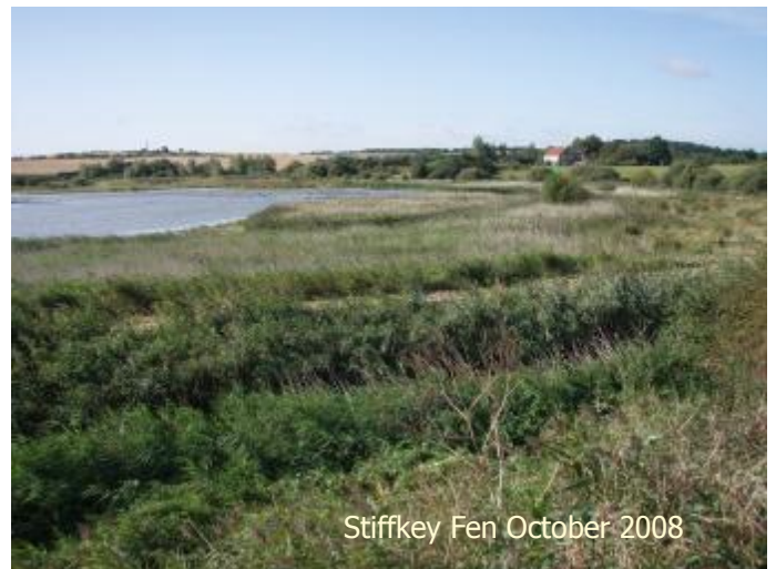
Stiffkey Fen October 2008

One of the first thing he did on his 500 acres was to change this, and use the drainage system in 'reverse', and manage the sluices to keep the meadows 'wet' into spring and early summer. This changed the ground conditions and food availability for young birds, and together with some 'scrapes', resulted over time with a large colony of breeding avocets. This was perhaps the earliest example in Norfolk of providing an alternative site to those on other parts of the coast, reclaimed some 200 years ago from salt marsh to give freshwater grazing marsh, that would in time revert back under the pressures of a receding coastline.