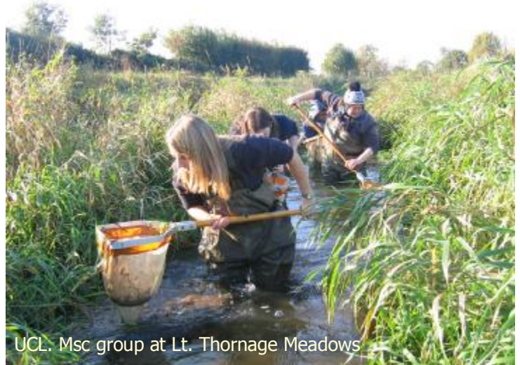
UCL. Msc group at Lt. Thornage Meadows

The 2006 survey was carried out at 30 sites on the main river and nine across the three of the larger tributaries, and used several types of search. The methods of search included 'stone-turning'; lifting vegetation; searching for