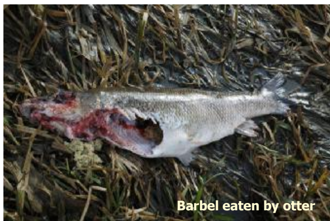
Barbel eaten by otter

DEFRA at one stage offered grant aid for fencing but there appears to be little progress with the scheme. One of the main problems is to assess what fencing is effective. However considering the extreme scenario, if all still waters were effectively fenced then there would be little hope for fisheries on the river. At Taverham Mills the otters have demolished goat netting fencing and the rabbit netting tried at East Ruston has similarly proved to be of limited effect: The otters simply knock it down or burrow under it. Otters will climb chain link fencing unless the fence is topped with 3ft. boarding to prevent them getting over. The cost of such fencing would be prohibitive to many fisheries.